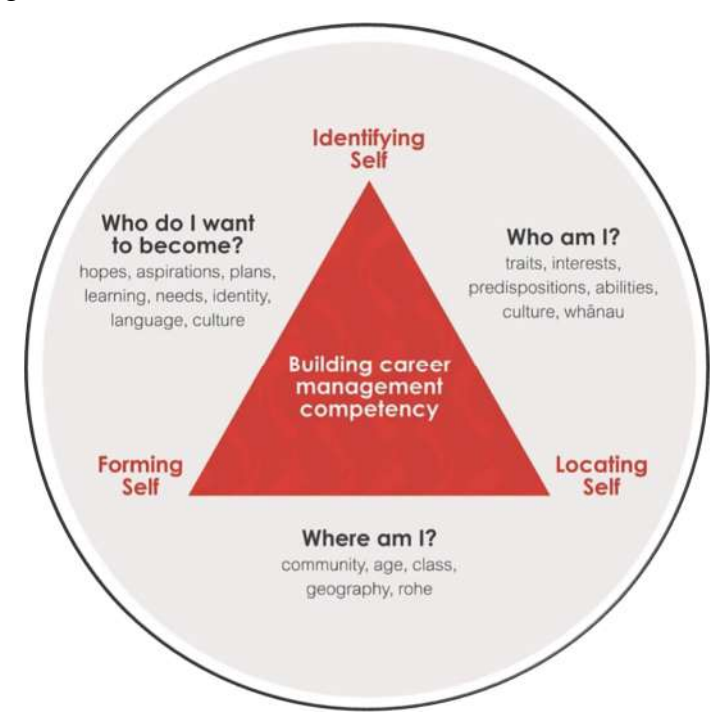
A competency approach to career development